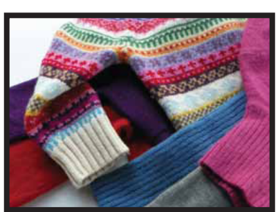
view full mitten gallery @ RebeccaMaeDesigns.com